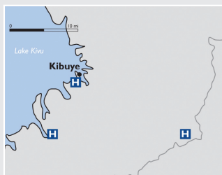
In the Western Province of Rwanda near Kibuye there are 3 hospitals .

We dream of the day when local churches, linked with community health systems and hospitals, provide basic healthcare to those in need everywhere! With the widest distribution and largest volunteer base, a network of millions of churches around the world is positioned to revolutionize healthcare, making it accessible and affordable to billions who have never enjoyed it.